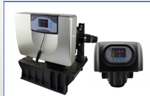
Duplex Softener Valves