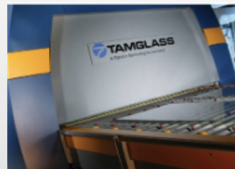
Water For Aluminum & Glass Industry