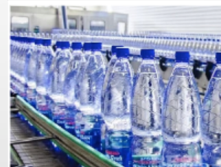
For Water Bottling Factories