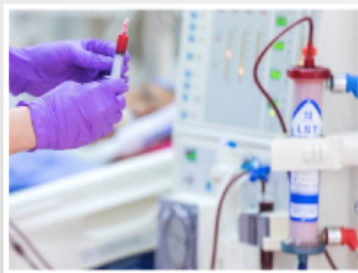
Medical Grade Ultra Pure Water