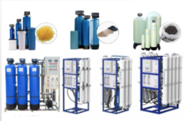
Reverse Osmosis RO & Water Treatment Systems | Industrial & Commercial

We offer a large selection of pre-engineered treatment systems to meet the specific needs of any sized commercial or industrial application. Our extensive experience in engineering and manufacturing allows us to leverage our vast library of pre-engineered solutions to customize a water treatment solution that best fits the specific needs of each customer.