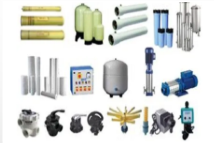
Parts & Components for Reverse Osmosis RO & Water Treatment