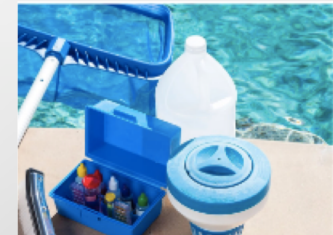
Swimming Pools & Spa Water