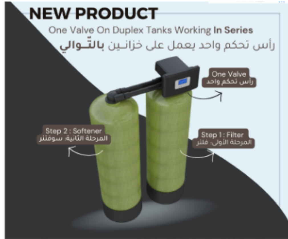
One Valve On Duplex Tanks Working "In Series"