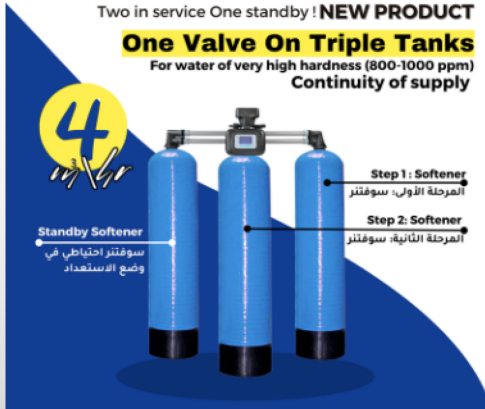
One Valve On Triple Tanks For water with very high hardness