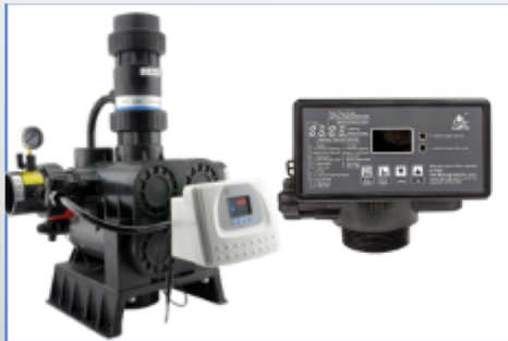
Single Softener Valves

RUNXIN WAS FOUNDED IN 2000, (FULL NAME WENZHOU RUNXIN MANUFACTURING MACHINE CO ) SPECIALIZES IN THE MANUFACTURE OF CORROSION-RESISTANT CERAMIC BALL VALVES, WATER PURIFIERS AND SOFTENERS, AND MULTI-FUNCTION VALVES FOR WATER TREATMENT SYSTEMS. AS EARLY AS 2005, ENGINEERS AT THE RUNXIN HEADQUARTERS IN WENZHOU CITY, CHINA, SUCCEEDED IN DEVELOPING THE FIRST MULTIFUNCTION VALVE FOR WATER TREATMENT SYSTEMS IN THE LINE.